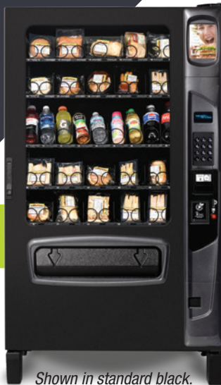
Shown in standard black.